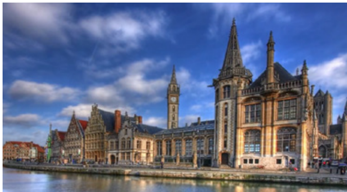
EVM Europe 6 Conference Will be held on December 2nd and 3rd 2014, at Ghent University in the beautiful medieval city of Ghent, Belgium