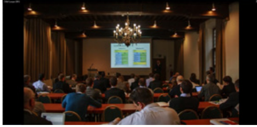
Conference Plenary Session - In the historic Het Pand Conference Center Ghent University, Belgium