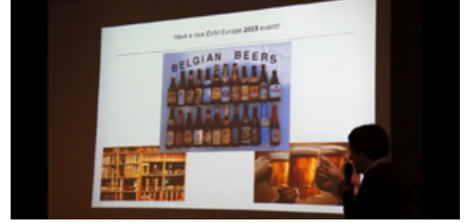
Belgian Beer - It seems mandatory that all events in Belgium include a discussion on Belgian beers!